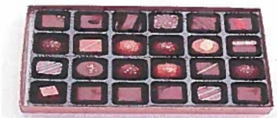
chocolates in the picture below:

Write an addition and or multiplication sentence that describes the total number of